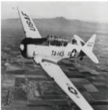
OLD T-6 OVER KOREA IN BACKGROUND